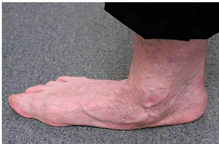
Fig. 5. A 68-year-old female with severe tibialis posterior tendon dysfunction and a collapsed pes valgus deformity. Note the severe pronation of the rearfoot and abduction of the forefoot.

Harper (39) in 1996, and Harper and Tisdell (40) in 1999, reported on isolated TN fusions for the acquired adult flatfoot. In these 2 separate studies, a total of 55 adults, mean age 58 (range 39 to 74)