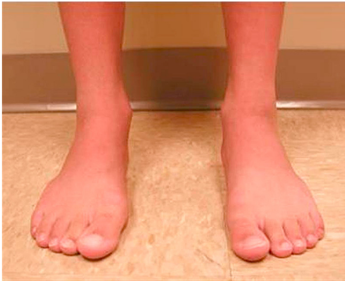
Fig. 8. At the 1-year follow-up visit, following bilateral talonavicular arthrodesis, note the improved alignment of the patient's feet.

however, that it would have been just as likely for progressive loss of correction and recurrence of symptoms to influence the outcome, and this would have biased toward a null effect of the arthrodesis. Last, because some of the patients who we evaluated had the surgery performed on both of their feet (at different times), and all of the patients were subjected to repeated measures, some of the data were linked (dependent) and all of it was subject to carryover effects, and these factors may have imparted some minor influences on our conclusions.