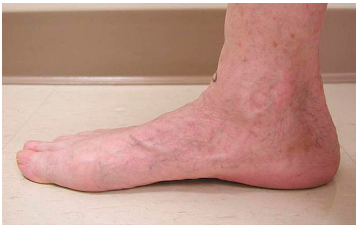
Fig. 6. At the 1-year follow-up visit, following talonavicular arthrodesis, note restoration of the patient's arch in comparison with the preoperative clinical view seen in Figure 5.