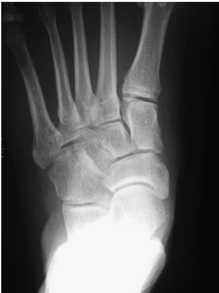
Fig. 3. Preoperative anteroposterior radiograph of a 68-year-old female who presented with a painful collapsed pes valgus deformity. Note the subluxation of the talar head from the navicular and the increase in Kite's angle.

calcaneal axial radiographs were not a component of our protocol so we were not able to indirectly compare our results with those related by Fortin (38). We did, however, encounter the development of post-surgical arthrosis involving the naviculocuneiform joint. In fact, 3.92% (2/51) of the feet upon which we operated underwent additional surgery for the treatment of painful naviculocuneiform arthritis following TN arthrodesis; and an additional 3.92% (2/51) feet also