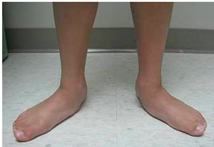
Fig. 7. A 12-year-old male patient with bilateral flexible collapsed pes valgus deformity.

In the cohort of patients described in this article, we observed a 100% rate of TN fusion. Despite this rate of union, we also observed a number of complications including bilateral delayed unions in a 65-year-old female. This particular patient required the use of an external bone growth stimulator, which was started on both feet at 14 weeks postoperatively. She required bone growth stimulation for 4 months on the left foot and 5 months on the right foot. She also had a 20-year history of smoking, but an otherwise unremarkable medical history. Only 2 other patients in our study were smokers, both had uneventful postoperative courses. Four patients (4 feet) developed secondary arthritic changes at the naviculocuneiform joint, 2 of which eventually required arthrodesis. Two patients (2 feet) developed subtalar joint pain; 1 resolved with a corticosteroid injection (1.0 mL marcaine 0.25% with epinephrine, 1.0 mL dexamethasone phosphate, and 0.25 mL dexamethasone acetate) and 1 required fusion. Four patients (4 feet) developed postoperative plantar heel pain that resolved with conservative treatment, and 3 patients (3 feet)