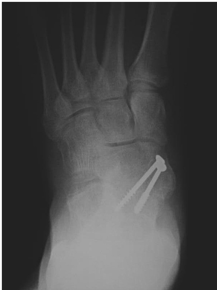
Fig. 4. A 1-year postoperative anteroposterior radiograph following isolated talonavicular arthrodesis. Note the relocation of the talar head behind the body of the navicular and the overall decrease in the Kite's angle.

developed subtalar joint arthritis, 1 of which required subsequent arthrodesis.