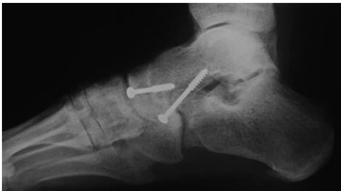
Fig. 2. A 1-year postoperative lateral radiograph demonstrating consolidation and correction following isolated talonavicular arthrodesis. Note the correction in the calcaneal inclination angle and the talar-first metatarsal angle.

calcaneal axial radiographs were not a component of our protocol so we were not able to indirectly compare our results with those related by Fortin (38). We did, however, encounter the development of post-surgical arthrosis involving the naviculocuneiform joint. In fact, 3.92% (2/51) of the feet upon which we operated underwent additional surgery for the treatment of painful naviculocuneiform arthritis following TN arthrodesis; and an additional 3.92% (2/51) feet also