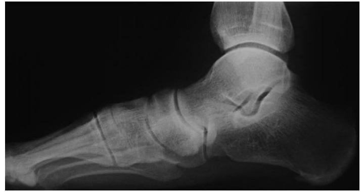
Fig. 1. Preoperative lateral radiograph of a 68-year-old female who presented with a painful collapsed pes valgus deformity. A decreased calcaneal inclination angle is visualized in addition to an increase in the talar-first metatarsal angle.

Lombardi, Dennis, Connolly, and Silhanek (34) reported the results of combined TN joint arthrodesis and Evans calcaneal osteotomy for the treatment of posterior tibial tendon dysfunction. At an average of 35 months follow-up, 10 of their patients demonstrated significant improvement in both their subjective discomfort and in the structural alignment and function of their feet. Their patients displayed an improvement in the average American Orthopaedic Foot & Ankle Society Ankle-Hindfoot Rating Scale when the pre- and postoperative (42.3/100 and 83.0/100, respectively) values were compared. Even though their sample size was relatively small and the follow-up period rather short, their results were favorable. Furthermore, they explained that their rationale for combining the TN fusion with the Evans calcaneal osteotomy was 2-fold. The Evans, they noted, was performed